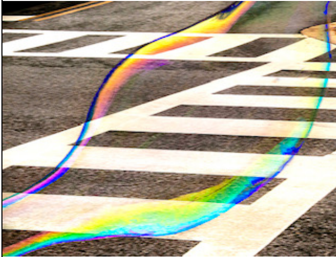
Street Crossing

You may be wondering what type of photos this judge prefers. Roz looks for something uniquely different, maybe something that stretches the imagination, perhaps a different perspective. Be creative!