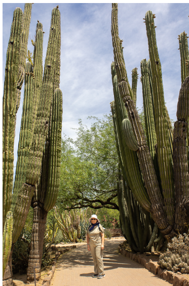
Desert Botanical Garden

I recently had an amazing opportunity to spend nine weeks in Arizona, where I had a great time exploring the desert and museums. In my job at NIH, I volunteered to be deployed to the Phoenix International Rescue Committee (IRC) to help the staff in their work with refugees from around the world. Most refugees have experienced trauma such as witnessing the death of a family member, or even torture. It takes an average of 10 years from the time they flee their homeland until they arrive in the U.S.