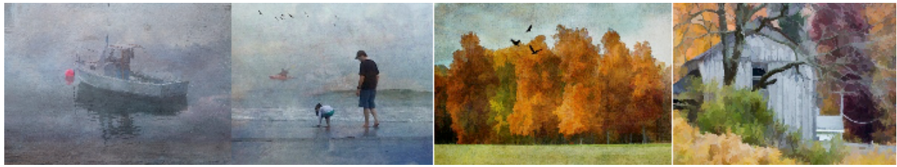
Energy © Betty Caldwell

The submission period for the program will start Wednesday, September 21 and end Sunday, September 25.