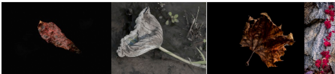
Feuilles Mortes