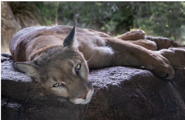
Tucson Mountain Lion

I ventured out of Phoenix and went on the scenic Verde Canyon Railroad near Cottonwood for a nice air-conditioned ride through the red rock canyons and