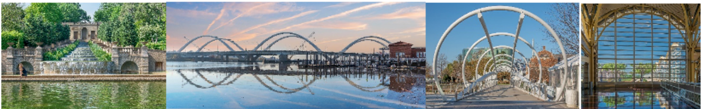
Unseen DC

The images and topics shown here are just a sampling of submissions from last year's Member Expo. In addition to these four topics, other topics included: Scratched, Whimsical Structures, Fanciful Notions, Streets of Paris, Pandemic Images, Brookside Gardens, Multiple, I Will Survive, Street Food, Sentient Beings, Spruce Forest, Colors of Maine, Upper New York State, India 1979. The only request we make is that your images not be just a travelogue.