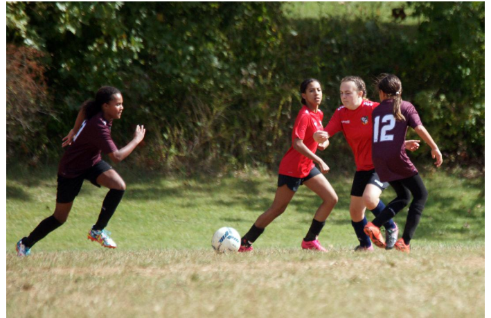
Soccer Game © Nellie D.