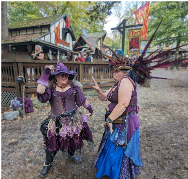
Renaissance Buddies