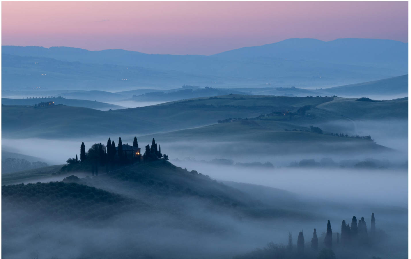
1st Place Under the Tuscan Mist

Volume 59 Number 3 November 2023 | nbccmdlensandeye@gmail.com | Website: www.nbccmd.org