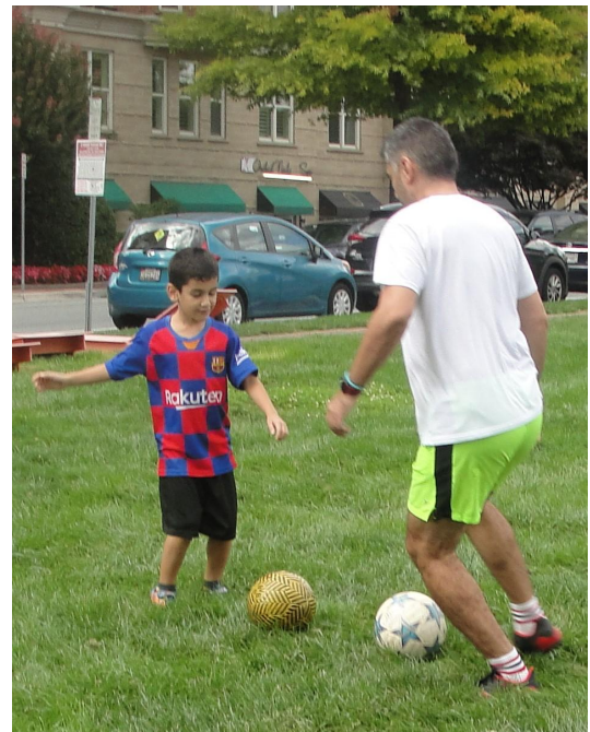
Soccer Practice