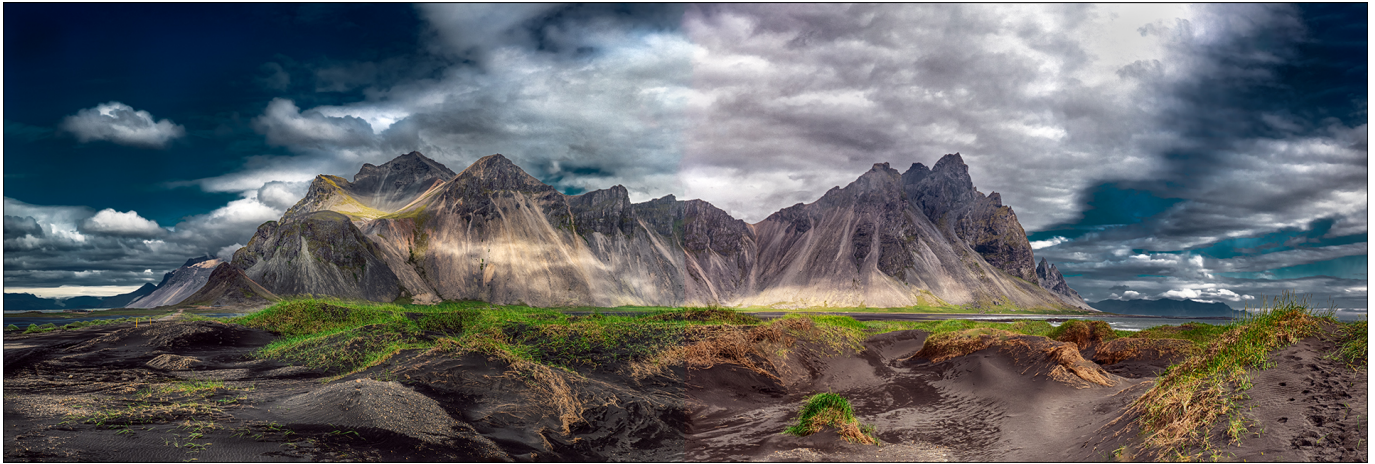
1st Place Icelandic Panorama

The image was taken near- Hérað – Berjaya Island, Iceland as part of a two-week photo tour that circumnavigated this lovely island country. This photographic site is on a peninsula in the mid-southwest region of the island, surrounded by rugged hills (small mountains). I shot under a cobalt-blue sky framed by white clouds, sand dunes, and the Atlantic Ocean. I created the individual images hand-held, using high ISO in-camera and lens vibration reduction settings to remove vibration blurring and excessive image grain. I did not use a tripod or other camera support. I joined the three images in Photoshop to create the final panorama.