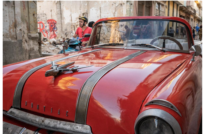
Red, Havana