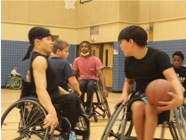
Wheelchair Basketball