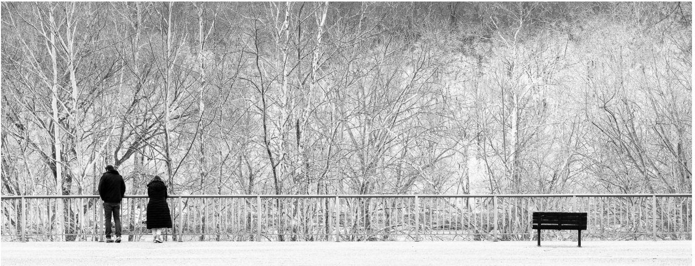
2nd Place Cold Feelings

The image was taken near- Hérað – Berjaya Island, Iceland as part of a two-week photo tour that circumnavigated this lovely island country. This photographic site is on a peninsula in the mid-southwest region of the island, surrounded by rugged hills (small mountains). I shot under a cobalt-blue sky framed by white clouds, sand dunes, and the Atlantic Ocean. I created the individual images hand-held, using high ISO in-camera and lens vibration reduction settings to remove vibration blurring and excessive image grain. I did not use a tripod or other camera support. I joined the three images in Photoshop to create the final panorama.