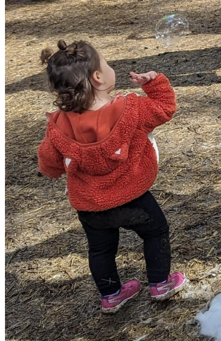
Popping Bubbles