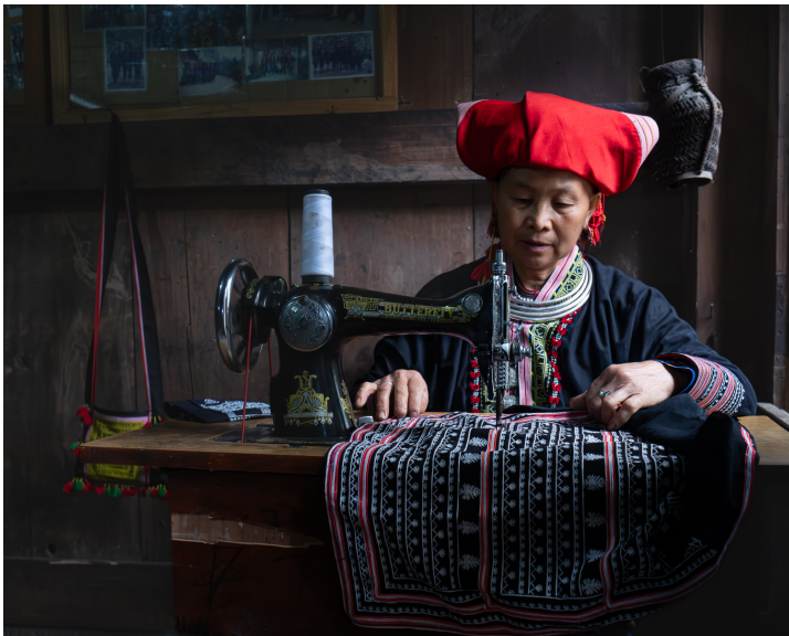
Photo taken at the seamstress' house in a small mountain village near Sapa City, in northern Vietnam. She was working at her sewing machine right next to a large open window that provided the only light to the room. The soft side light was just right to accentuate her features and provide depth. It was processed in Lightroom.

3rd Place Glorious Grasses