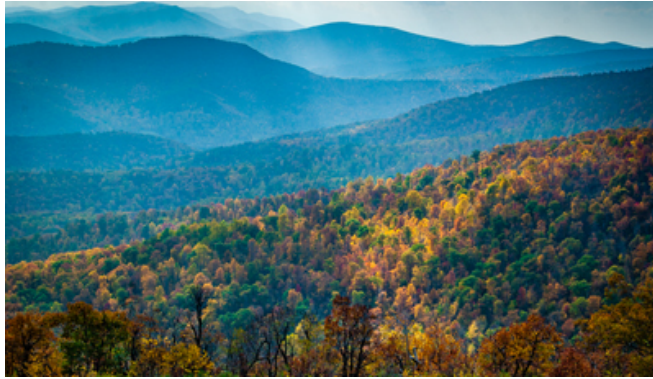
Shenandoah images

Enjoy glorious vistas, intimate scenes, and fall color in the Shenandoah National Park the weekend of October 20-21. Limited to 12 members, this field trip will start at dawn on Saturday and will include several stops along Skyline Drive, an optional hike to a waterfall, possibly an old car and carriage museum in Luray, and a sunset shoot. We will have lunch and dinner together on Saturday at one of the lodges. One possibility for Sunday might be to drive home through Sperryville and/or Little Washington, where there is a lot of history and small town/rural images. The specific itinerary is still being researched, so please let us know if you have a suggestion.