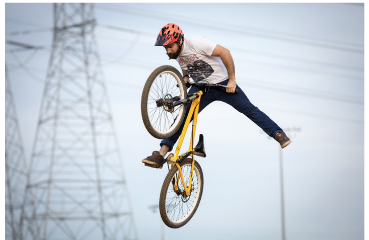
(shot at 200mm)