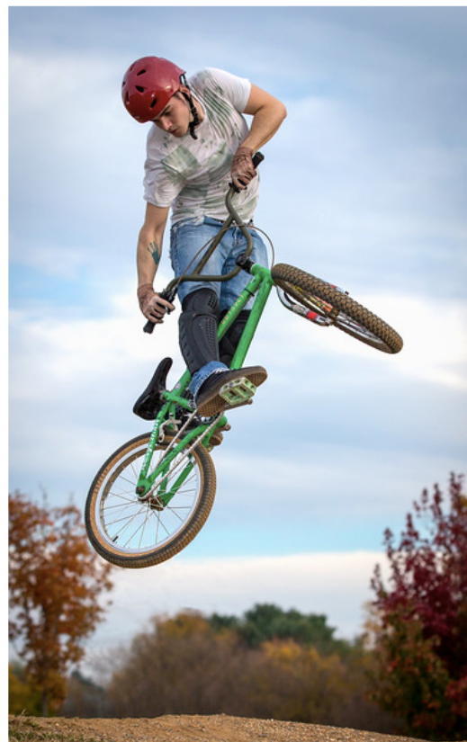
(shot at 157mm)