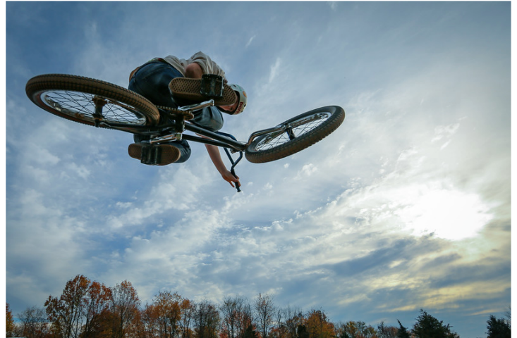
© James Corbett (shot at 14mm)

The day's schedule is shown on the next page. During each group orientation, photographers will be required to sign MORE's participant waiver, as required by the club's insurance.