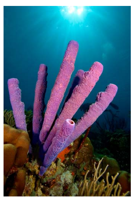
Purple Tube Sponges – Tom Field

Perhaps you've heard that Tom Field is "all wet" when it comes to photography. Sometimes it's true, and that's exactly what he'll be talking about on February 28: photographing the natural world beneath the ocean's surface.