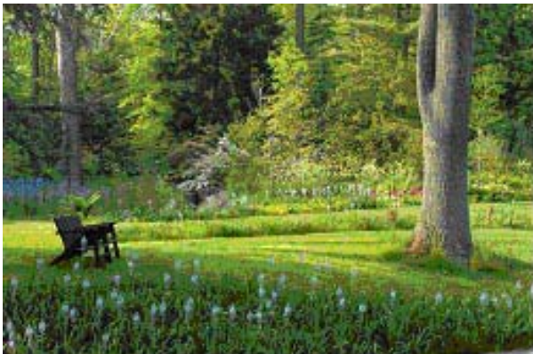
Streambed seats among Camassia in bloom

other. In the field, both instructors made a point of seeking out each of us individually and offering advice, pointers, and suggestions about technique and composition. With so much ground to cover, it was hard to know where to start, when to stop, and to try to make each shot count, since we were allowed to turn in only 36-40 images (in order to even the playing field between those of us shooting digital versus those participants shooting slides). Over boxed lunches we had more opportunities to exchange points of view and notes with each other and the instructors, who talked about the special challenges and rewards of photographing gardens, as well as what they had been looking for in selecting applicants for the workshop (answer: different things, but above all a "good eye" and a basic level of skill and technique so that they wouldn't spend time on what Detrick termed the "running man versus tulip digital camera setting" question).