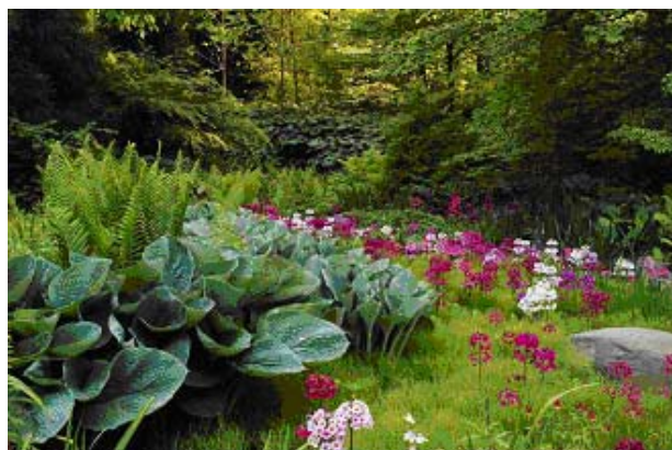
Primulas blooming near a bridge in the woodland garden

successful stock photographer who also photographs gardens for landscape architects and designers. Foley (who lives in the Washington area and whose website is under construction) is perhaps best known for his photographs of many gardens designed by the team of Oehme, van Sweden and for his own successful books (most recently Washington's Gardens at Mount Vernon ) and numerous awards for photography from the Garden Writers of America; he is also sought after by many landscape construction firms to photograph gardens they plan to enter in various design competitions. He is still devoted to film (Velvia 50 and 100) although he scans many of his slides, works with the images in Photoshop, and prints via his digital darkroom. Detrick and Foley are longtime colleagues and friends and worked well as a team.