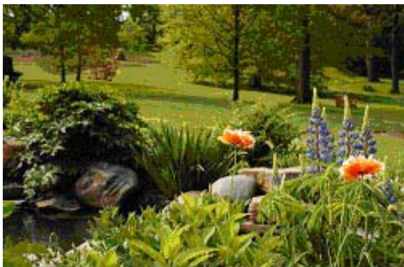
A "floating face" in one of Chanticleer's water features provides a mysterious backdrop for poppies and blue Camassia.

( www.chanticleergarden.org ) is unlike any garden in the Washington area. It's filled with exotic plants, unusual benches and sculpture, a structure called The Ruins, a large bog garden, woodland areas filled with bulbs in spring, and a serpentine sculpture of wheat and boulders – just to name a few of its aspects. You can shoot wide vistas, plant combinations, macro views, and everything in between. While Chanticleer is probably at its peak in late summer and early fall, there was plenty to see, appreciate and photograph while we were there.