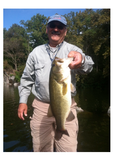
A fish.