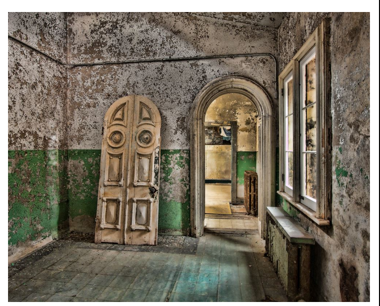
Chapel Doors, © Lori Ducharme

(Look familiar? You may recall that this image also won NBCC's Unrestricted Electronic Image of the Year in 2011.) \clubsuit