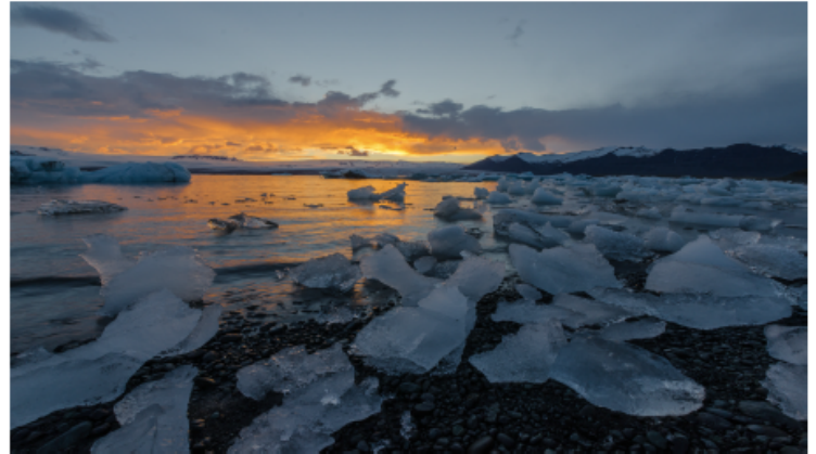
Ice Lagoon Sunset