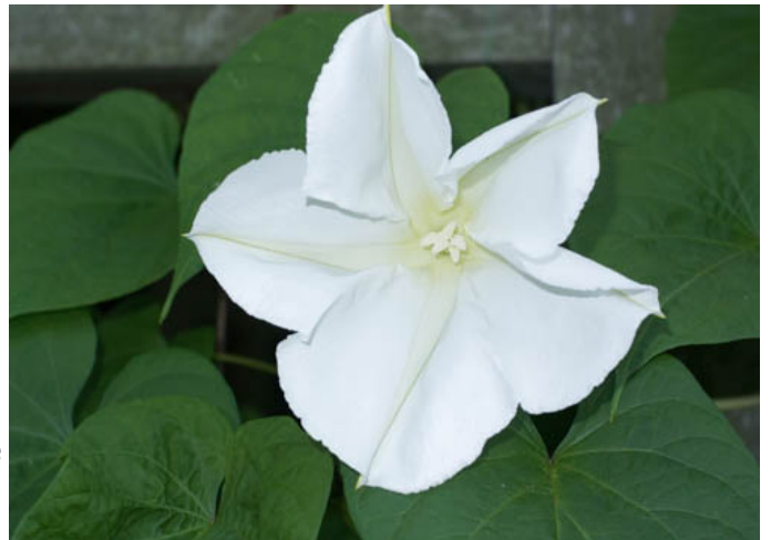
Image 1 - Overexposed

OK so far, but the blur would not be quite enough to separate the blossom from the leaves, I wanted more. To get more, I popped up that dumb little flash that comes with the V3. That thing is tiny, but with luck, it would be enough for my plan. What I wanted to do was to use the flash to pop the white blossom. This would happen mostly because of the flash light falloff on the leaves. Flash illumination falls off with the square of the distance from the flash, and with the camera to subject distance at 1.5 feet (minimum focus distance), those inches between blossom and leaf take their toll on the light. The leaves are not as lit as the blossom. I wanted a muted flash, something to provide a bit of directional light, so I set the flash to TTL and cut its output by 1.7 stops. All I wanted was a flick of light. I would adjust if I needed to. Image 1 shows the initial result.