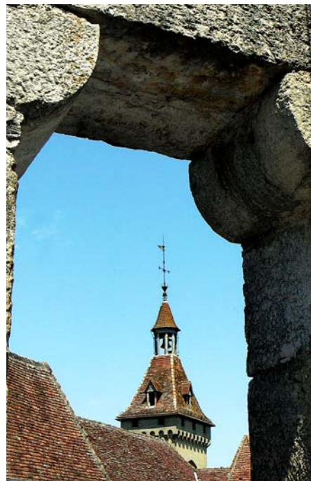
Castle Tower Framed on Stone – Les Trachtman