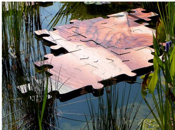
Garden Puzzle – Les Trachtman