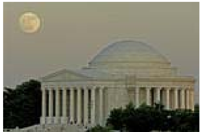
Moon Over Jefferson Memorial