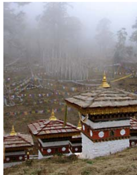
Chotens and Prayer Flags