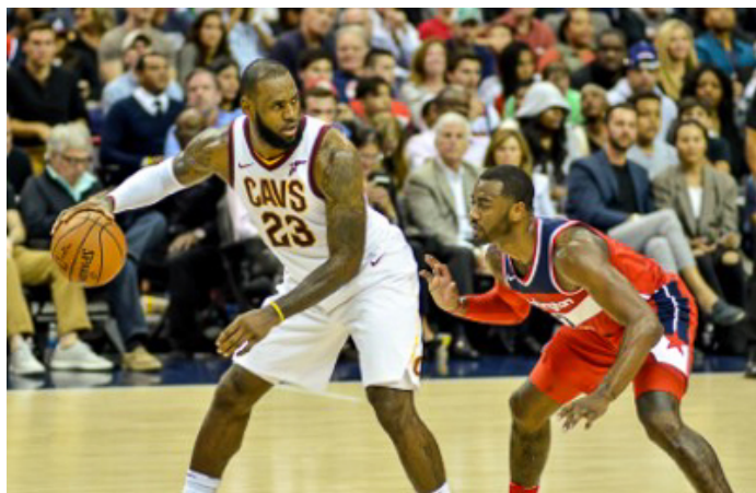
3rd Place LeBron vs John Wall

I took the photograph at the 40th anniversary celebration of the Takoma Park Folk Festival (my son, who was chairman of the event, enlisted me to photograph the activities because, at the last minute, the photographer he previously engaged was sick). After the formal presentations, I saw these women in animated conversation, around a picture on an iPhone, having great fun. They were all linked by the color purple: t-shirts, and in one case, purple hair. Totally not posed. I used my iPhone because my DSLR malfunctioned a few minutes earlier ("the best camera is the one you have with you"). No post processing was used except for cropping.