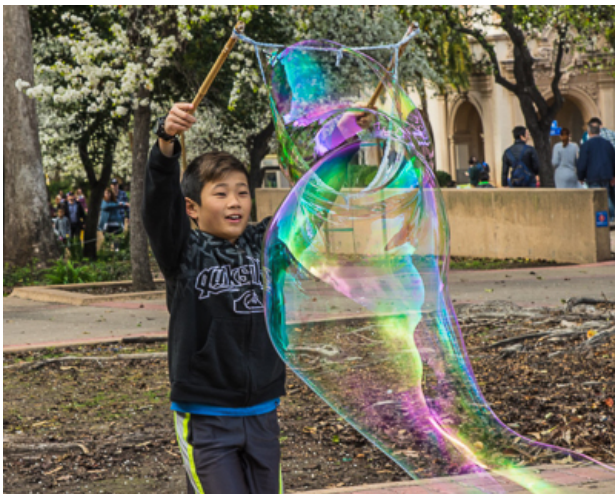
3rd Place Steady Hands

My wife and I were walking our dog on the beach in Ocean City, MD when we saw this beautiful young girl playing on the beach. It appeared that she was looking for shells. I loved the way her hair was braided and the bright orange dress she was wearing. I had to go back to our room to get my camera. It was kind of a gray day. Luckily, she was still on the beach when I returned and took the picture, making sure that I included her reflection in the water left on the beach after the wave went out. This has always been one of my wife's favorite pictures.