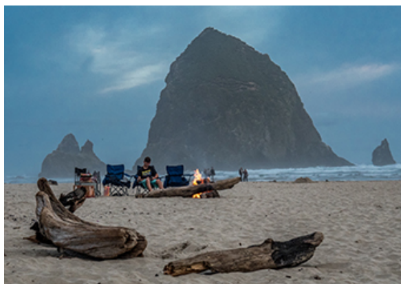
Gold medal winner; Keeping Warm