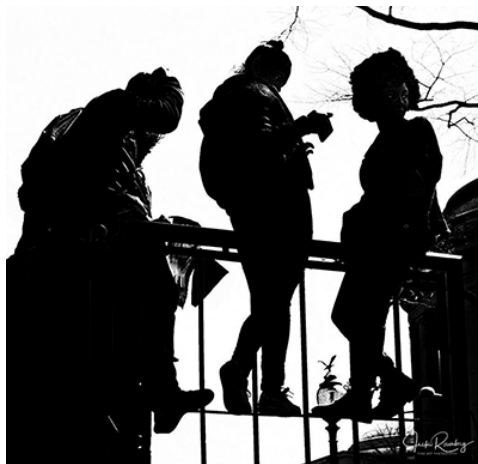
Watching the March from the Top of the Fence