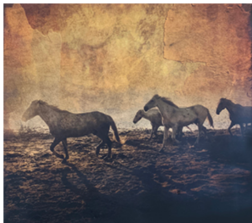
Camargue Herd Dawn

Sue writes articles for leading photography magazines including Shutterbug and After Capture. She is a regular contributor to Australia's Better Photoshop Techniques.