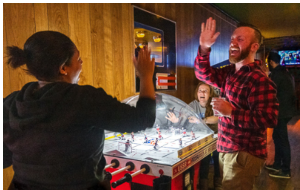
1st Place Yea, I Won

Site: The Players Club on 14 th Street, an adult arcade and play space, on a Friday night. These venues present very difficult lighting situations (generally quite dark and often lit with fluorescents). Pool tables and unlit games were too dark and offered odd color casts. Pinball-like machines were too bright and angles on players were difficult. Mini basketball only allowed rear views. This lit Bubble Hockey game offered upward light on the players faces. It was the magic solution. I did a lot of shooting that night but never without the permission of the participants to whom I offered copies of any results worth seeing! They were all very gracious. Shot with Nikon D500 and Tamron 10-24 mm wide angle lens, ISO 4000, f 4.2, 1/50 sec. Standard LR work, followed by multiple PS layers to deal with hot spots and color casts.