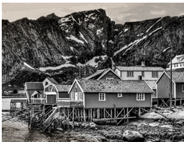
Silver medal winner; Cabins on Stilts