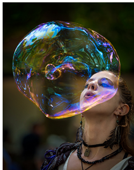
Blowing Bubbles

For more winning images from the March competition, see pages 11 -14.