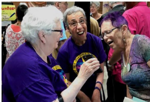
2nd Place Purple Ladies

Site: The Players Club on 14 th Street, an adult arcade and play space, on a Friday night. These venues present very difficult lighting situations (generally quite dark and often lit with fluorescents). Pool tables and unlit games were too dark and offered odd color casts. Pinball-like machines were too bright and angles on players were difficult. Mini basketball only allowed rear views. This lit Bubble Hockey game offered upward light on the players faces. It was the magic solution. I did a lot of shooting that night but never without the permission of the participants to whom I offered copies of any results worth seeing! They were all very gracious. Shot with Nikon D500 and Tamron 10-24 mm wide angle lens, ISO 4000, f 4.2, 1/50 sec. Standard LR work, followed by multiple PS layers to deal with hot spots and color casts.