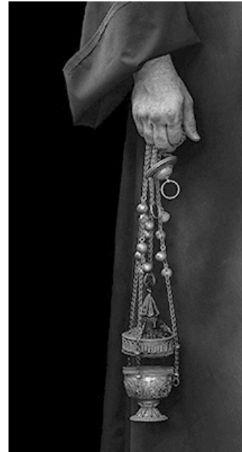
The Armenian Monk © Diane Poole