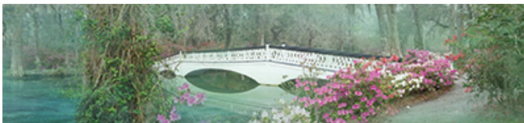
Magnolia Plantation Bridge