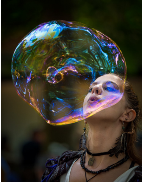
1st Place Blowing Bubbles

This image was taken at the Maryland Renaissance Fair. The lady had a technique to blow huge bubbles with a bubble within a bubble.