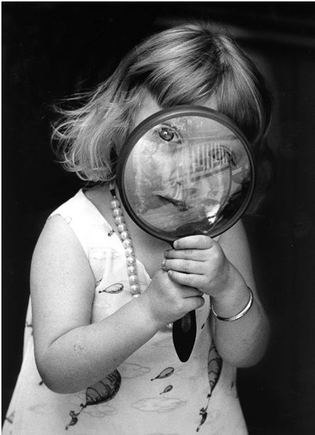
1st Place The Magnifier

A cute kid got bored at a big family lunch, so I took her outside the restaurant and had her hold a magnifier glass. I made a special effort to pose her so that the railings of porch were included in the glass to achieve a feeling of mystery. Taken with 35mm Ilford film.