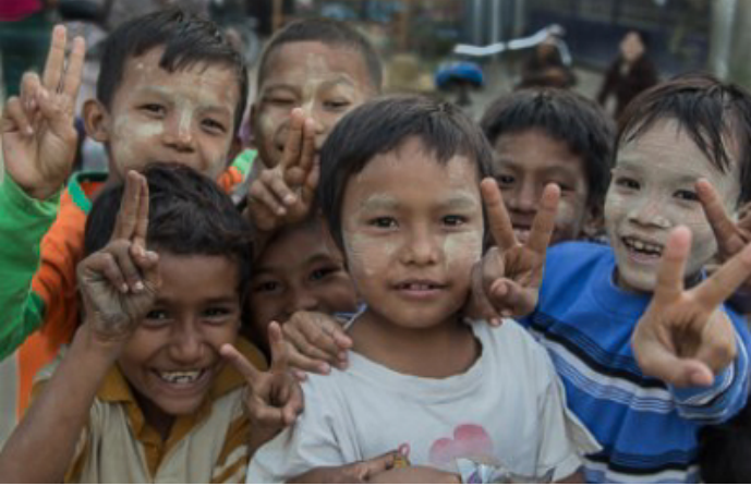
1st Place Street Urchins

I was walking through a fairly traditional neighborhood in Burma doing street photography. These kids were fascinated by this gringo in their midst, something they didn't see all that often. It was big entertainment for them to crowd around me and then see the image on the back of my camera.