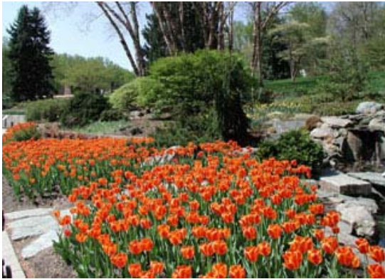
Tulips in blossom at Brookside Gardens

Brookside Gardens is located at 1800 Glenallan Avenue, Wheaton, MD. There are three entrances into the grounds. Use the second one that opens to the greenhouse, called the Conservatory. Remember, you may not use tripods in the gardens' conservatory. The conservatories are open from 10 a.m. to 5 p.m.