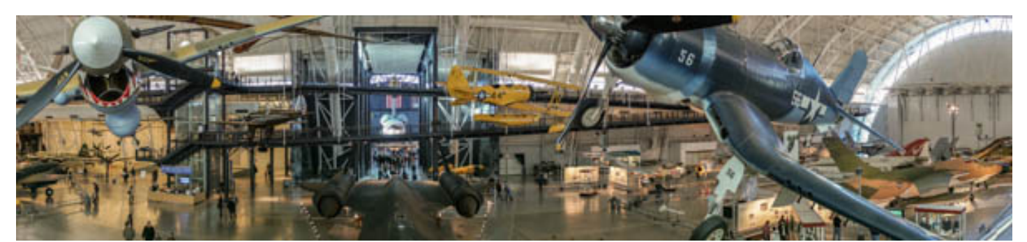
Udvar-Hazy Center, Dulles. Sweep panorama, auto-stitched in-camera. Sony NEX-5N mirrorless system